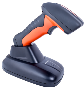
SAVEO-RGDPTL-Z1D-BT Quick Start Guide