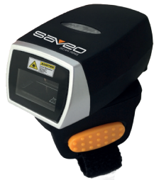
SAVEO-RNG-Z1D Quick Start Guide