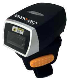
SAVEO-RNG-H2D Quick Start Guide